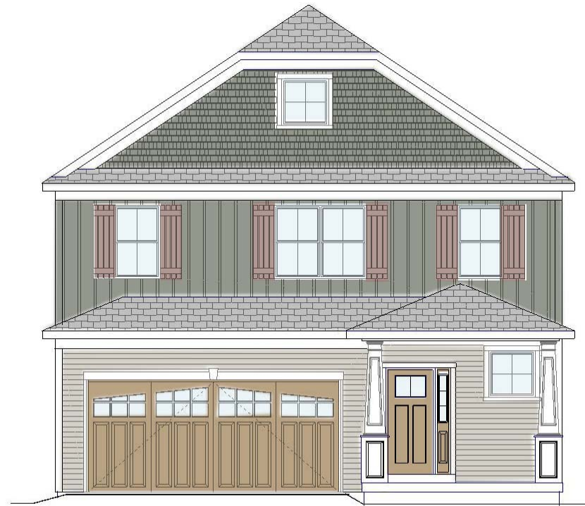
ALTERNATE FRONT ELEVATION