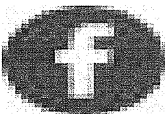
image012.jpg 921 B