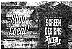
image011.png 121 KB